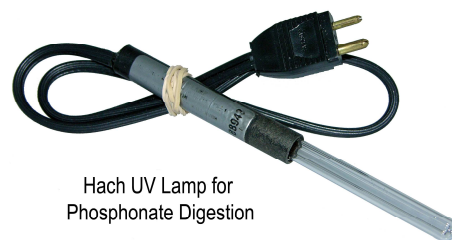
Hach UV Lamp for Phosphonate Digestion

IMPORTANT NOTE: It is always important to use clean glassware when performing any type of chemical analysis. In the phosphonate digestion test, it is critical . The vessel that is used for the actual digestion of the sample must be cleaned after each digestion using Chemtex D-504 reagent. Simply swirl a few drops of D-504 around the vessel to make certain all the interior surface is contacted by the reagent, then rinse with distilled water. Of course, if you use a colorimeter for the orthophosphate determination (or any other test, for that matter), you should make certain the tubes used in the colorimeter are kept clean as well.